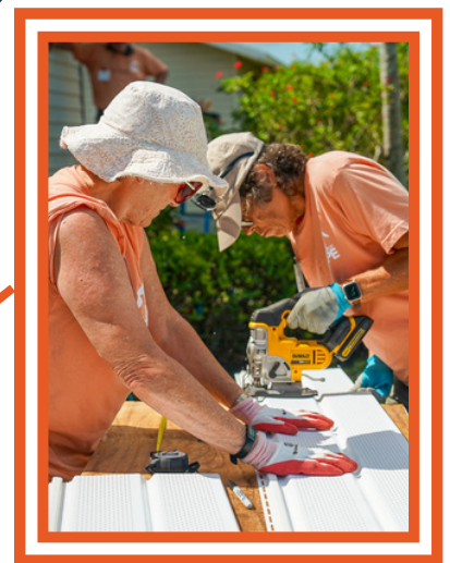
Fort Myers, FL